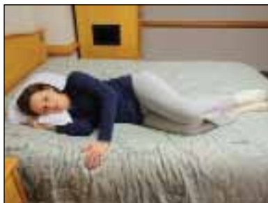
Roll to one side.