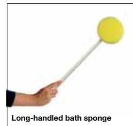
Long-handled bath sponge