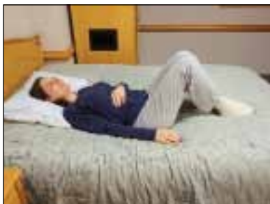
Bend your knees.

Your nurse or physical/occupational therapist will review a “log rolling” technique to get in and out of bed.