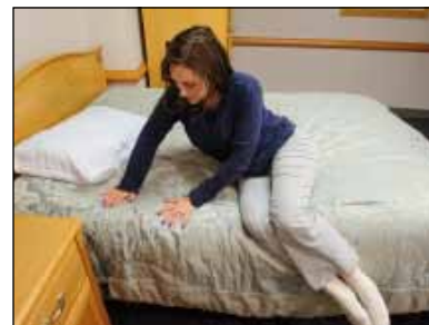
Use your arms to push yourself up.

Your nurse or physical therapist will also help you with proper technique in sitting and standing and transferring to the tub/shower.